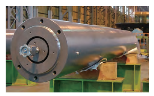
Steel pressure vessel for hydrogen storage

Incorporating high-level technologies, our low-cost, highly durable steel pressure vessels are being adopted in the "Hydrogen Leader City Project" in the city of Fukuoka and elsewhere.